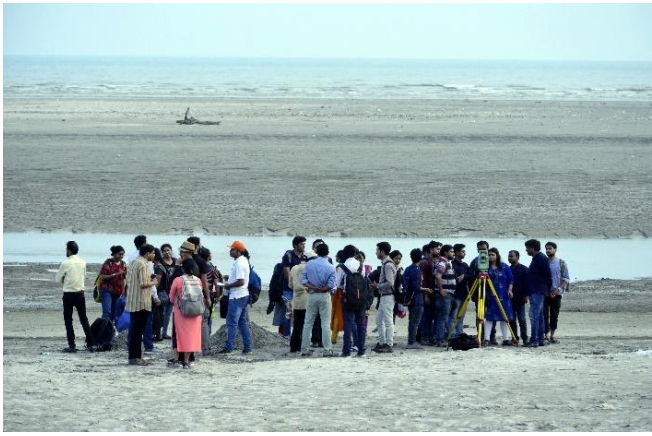
Bathymetric survey of Hatania-Doania River by using Echo-sounder (left image). Survey of beach morphology at Bakkhali (right image).